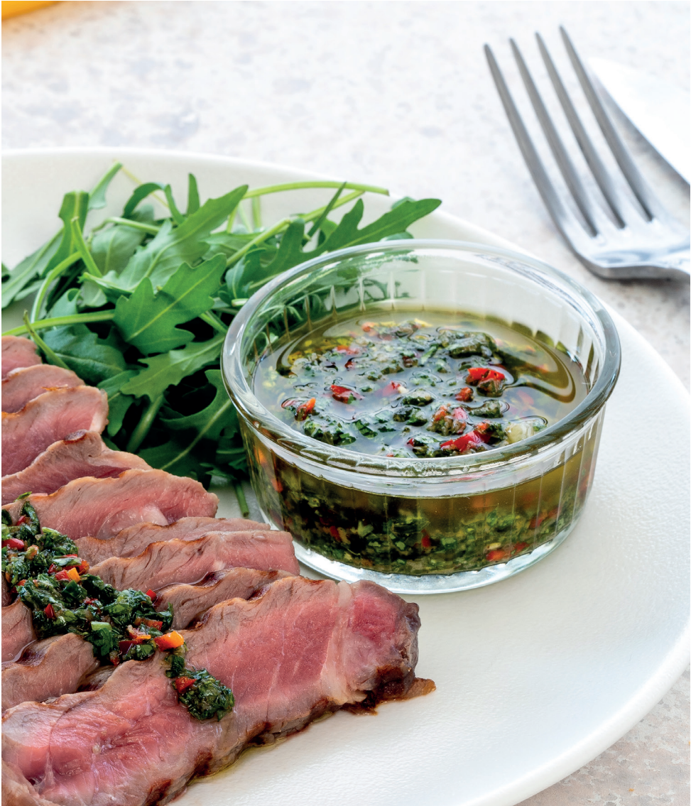
Grilled steak with chimichurri sauce