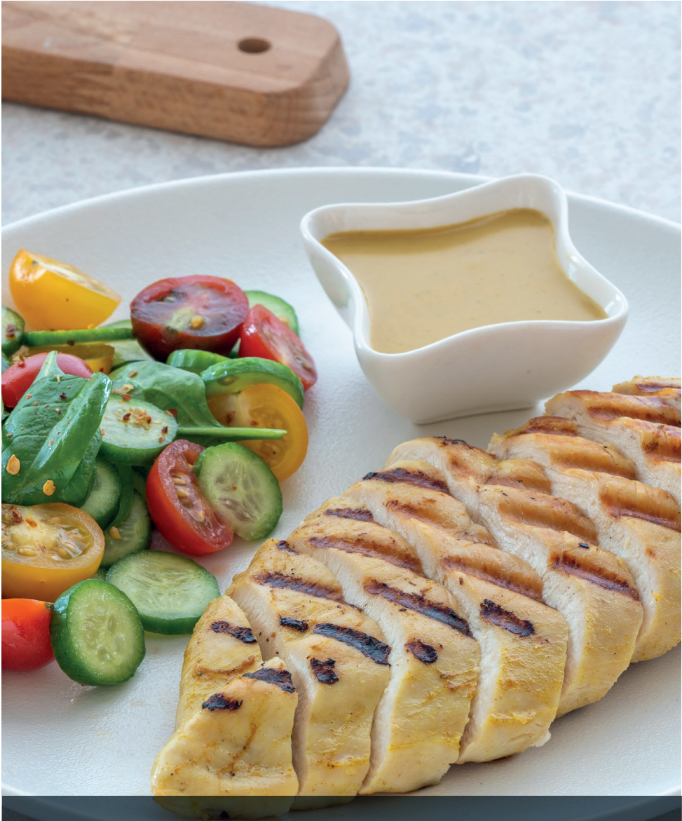
Grilled Satay chicken