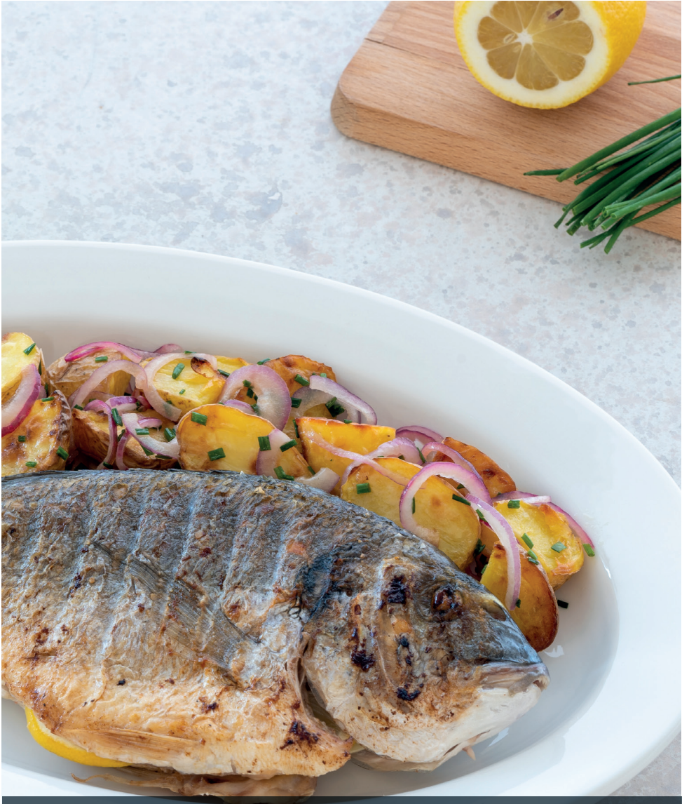
Grilled fish with baked potato salad