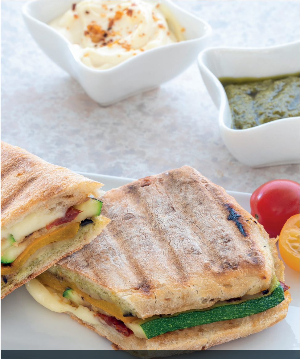
Grilled vegetable panini