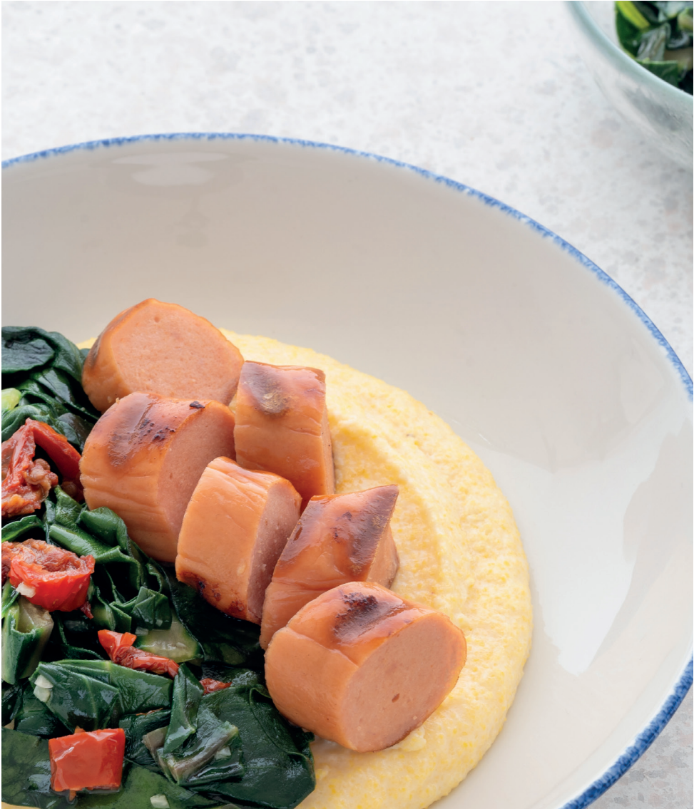
Grilled sausage with creamy polenta