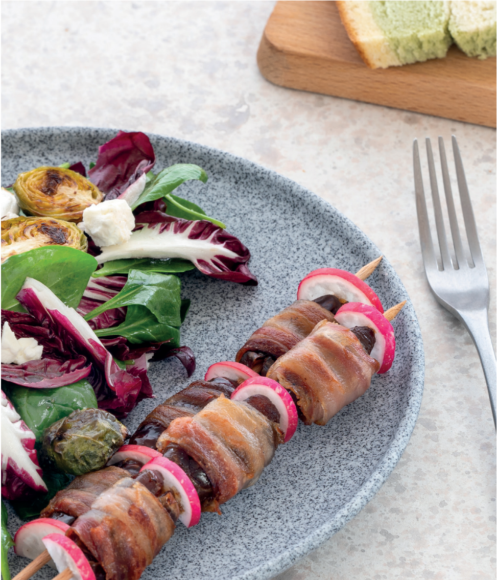
Bacon wrapped date salad